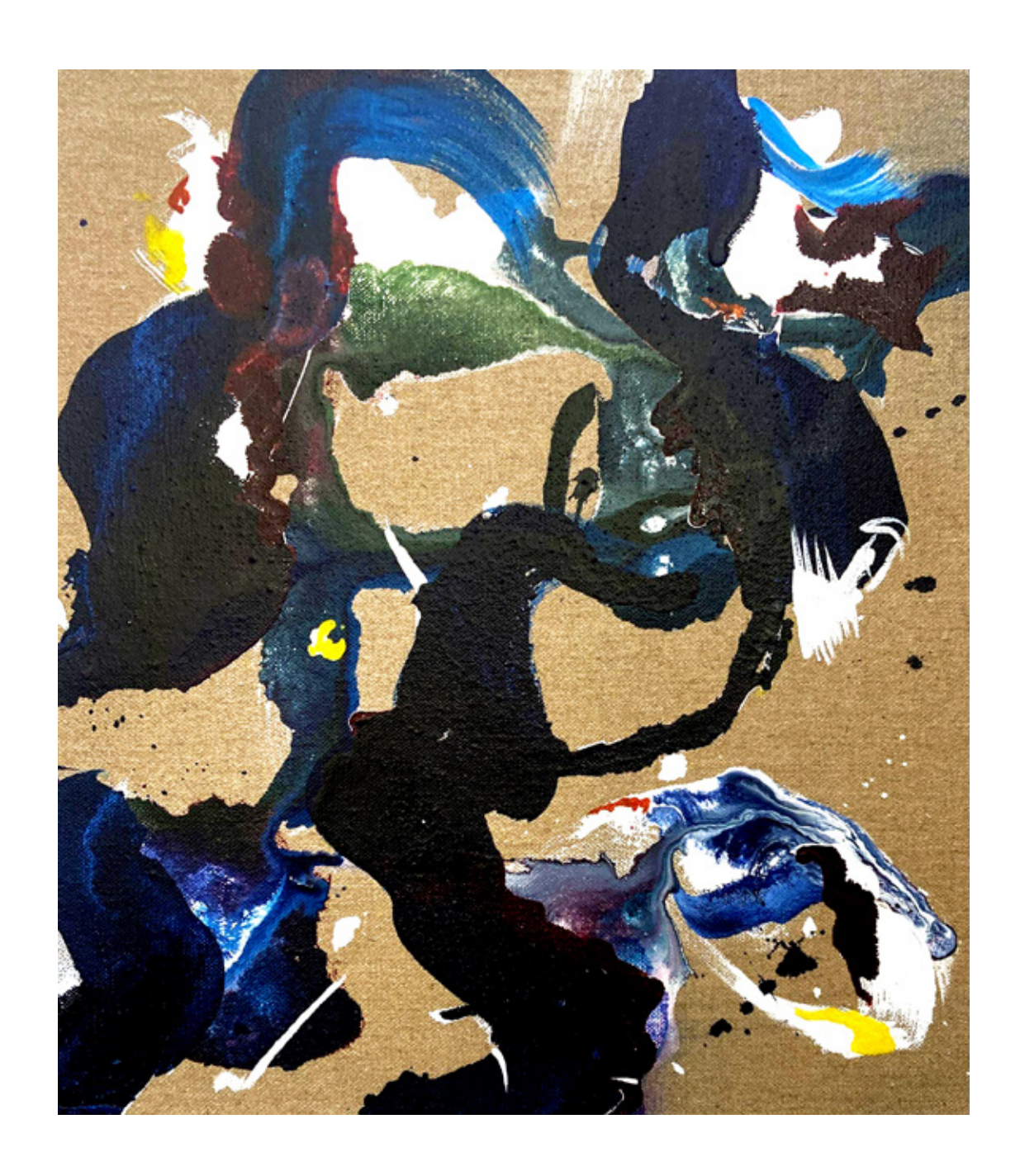
Alicia Viebrock Baboy 2020 Ink and acrylic on canvas 60 x 50 cm