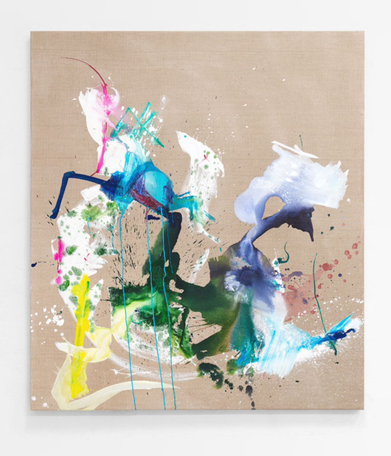
Alicia Viebrock Season of the witch 2022 Ink and acrylic on canvas 170 x 160 cm