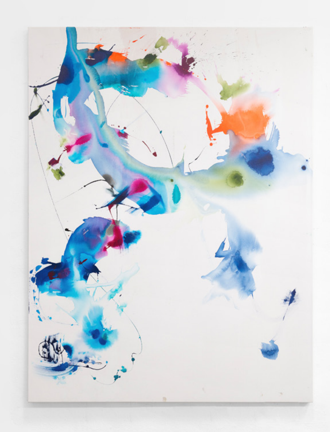
Alicia Viebrock Lonely hearts coulmn 2022 Ink and acrylic on canvas 200 x 150 cm