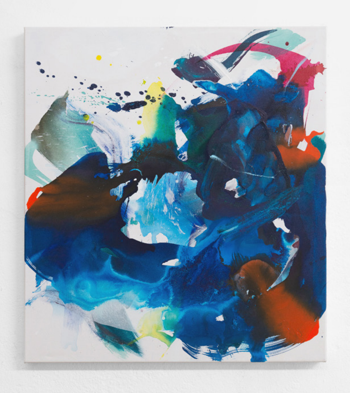
Alicia Viebrock So sad so sexy 2022 Ink and acrylic on canvas 90 x 80 cm