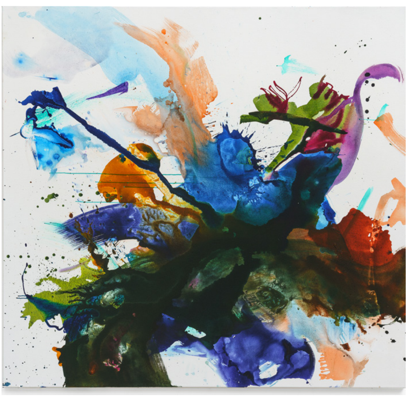
Alicia Viebrock Atom Heart 2021 Acrylic, ink and binder on canvas 170 x 160 cm