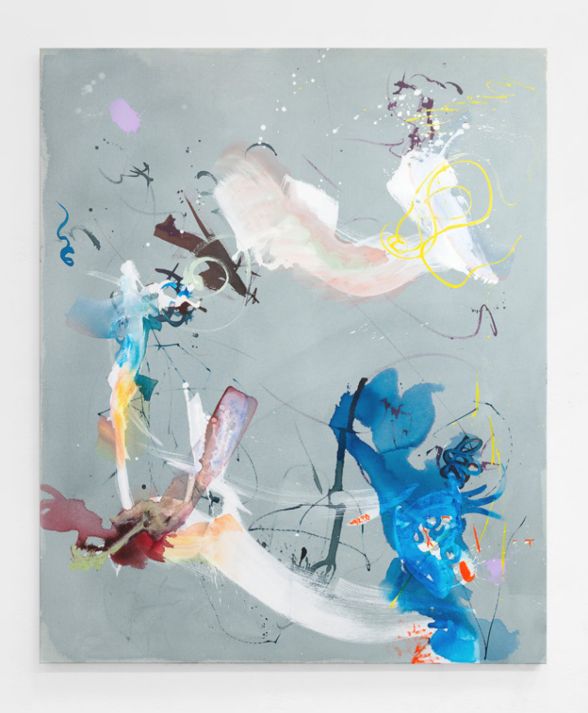
Alicia Viebrock Arms of another 2020 Ink and acrylic on canvas 180 x 150 cm