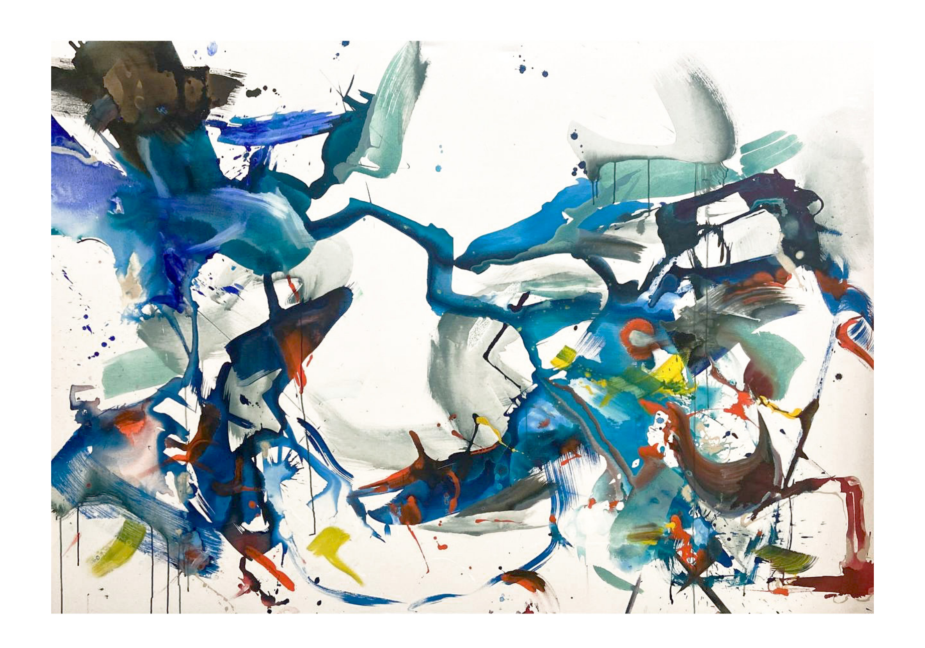
Alicia Viebrock Doppelgänger 2022 Ink and acrylic on canvas 160 x 220 cm