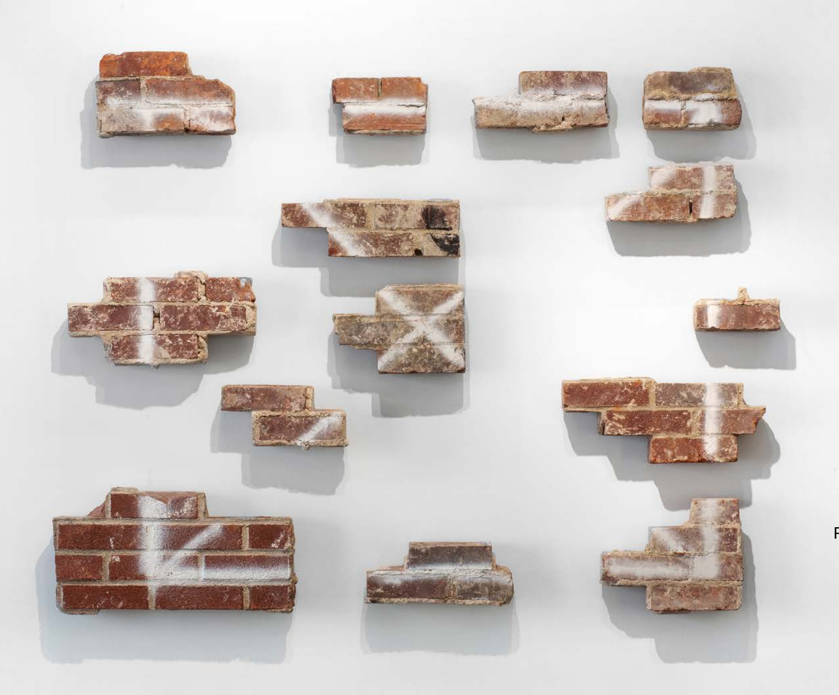
Pablo Rasgado Ventana, 2019 Bricks 133 x 168 cm