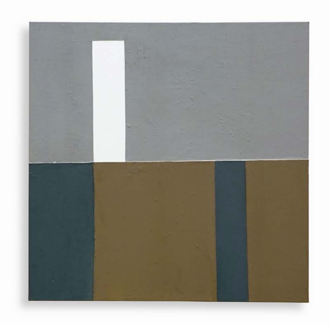
Pablo Rasgado Cut Corner, 2021 Extracted vinyl acrylic paint on canvas 36 x 36 x 1.5 in