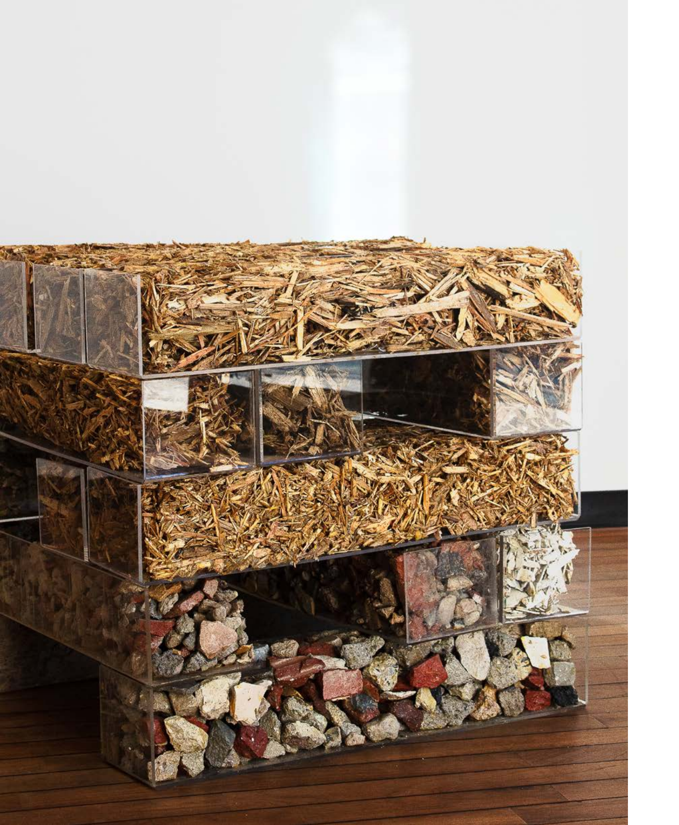
Pablo Rasgado Casa mínima (detail), 2019