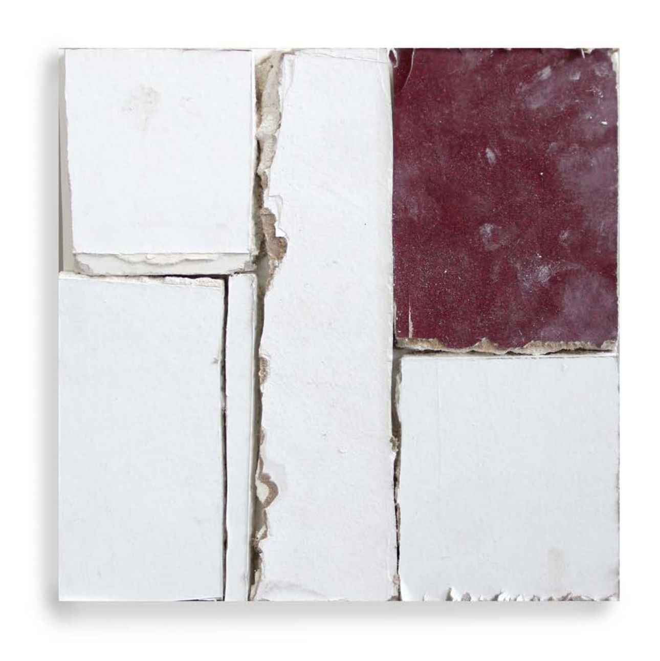
Pablo Rasgado Unfolded Architecture, 2012 Drywall from Teresa arte actual 25 x 25 cm