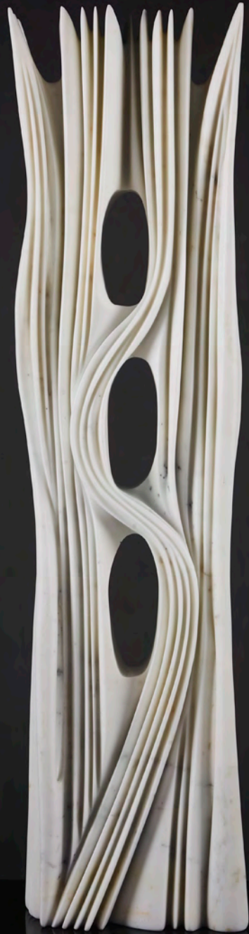
Pablo Atchugarry Untitled, 2022 Carrara Marble 120.5 x 31 x 19 cm. USD $145,000.00