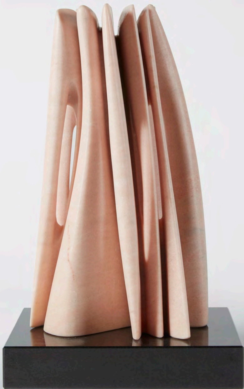
Pablo Atchugarry Untitled, 2015 Pink Portugal marble 48.5 x 26 x 19.5 cm. USD $70,000.00