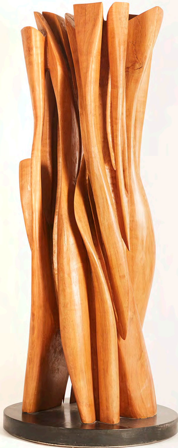
Pablo Atchugarry The giant of nature, 2010 Cherry wood 173 x 54 x 62 cm. USD $190,000.00