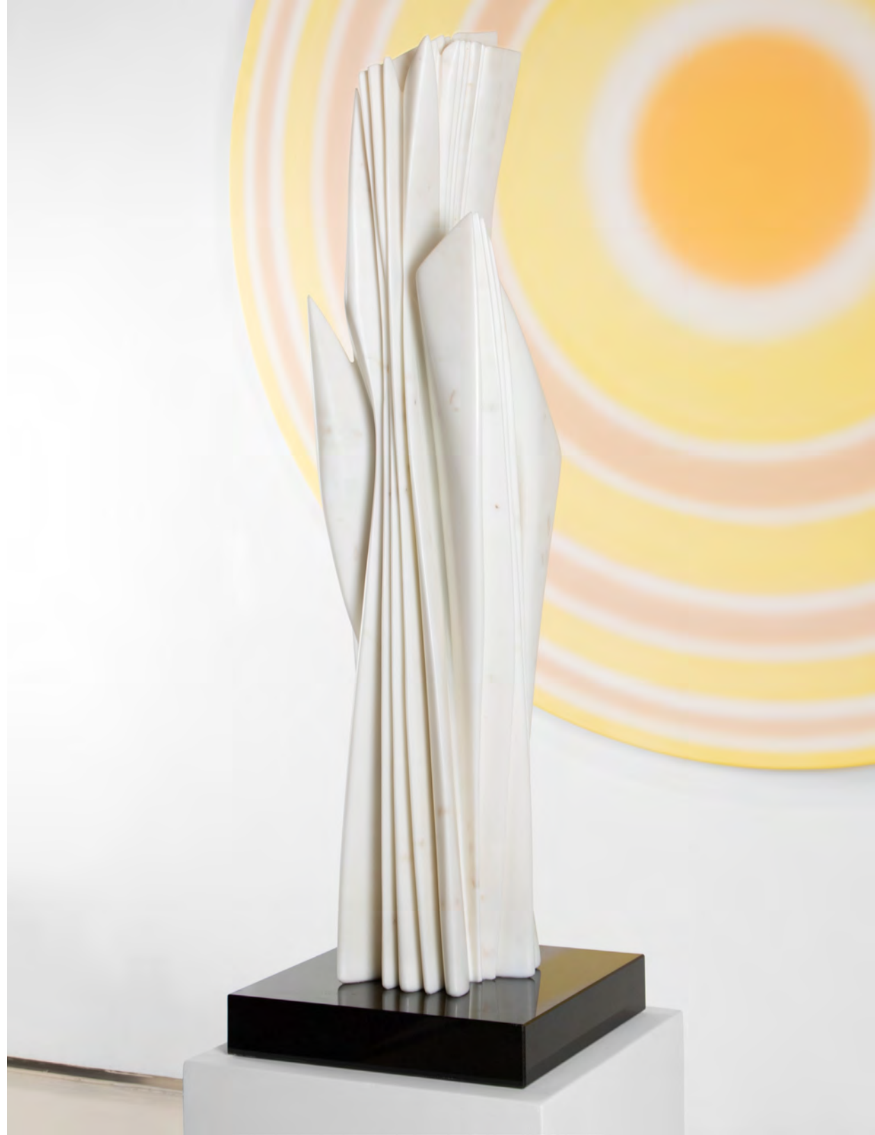
Pablo Atchugarry Untitled, 2013 Carrara Marble 122 x 24 x 23 cm. USD $170,000.00