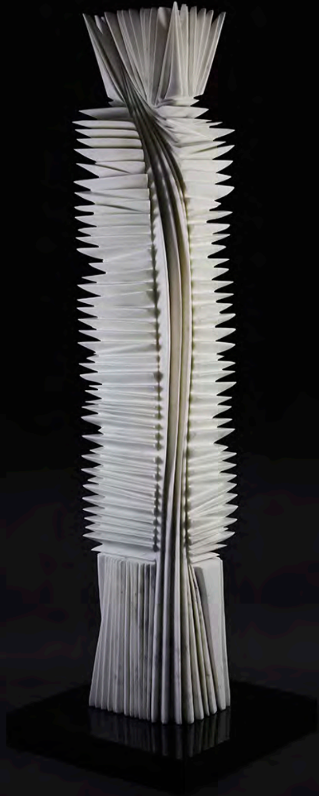
Pablo Atchugarry Untitled, 2021 Carrara marble 210 x 37 x 31.5 cm. Sold