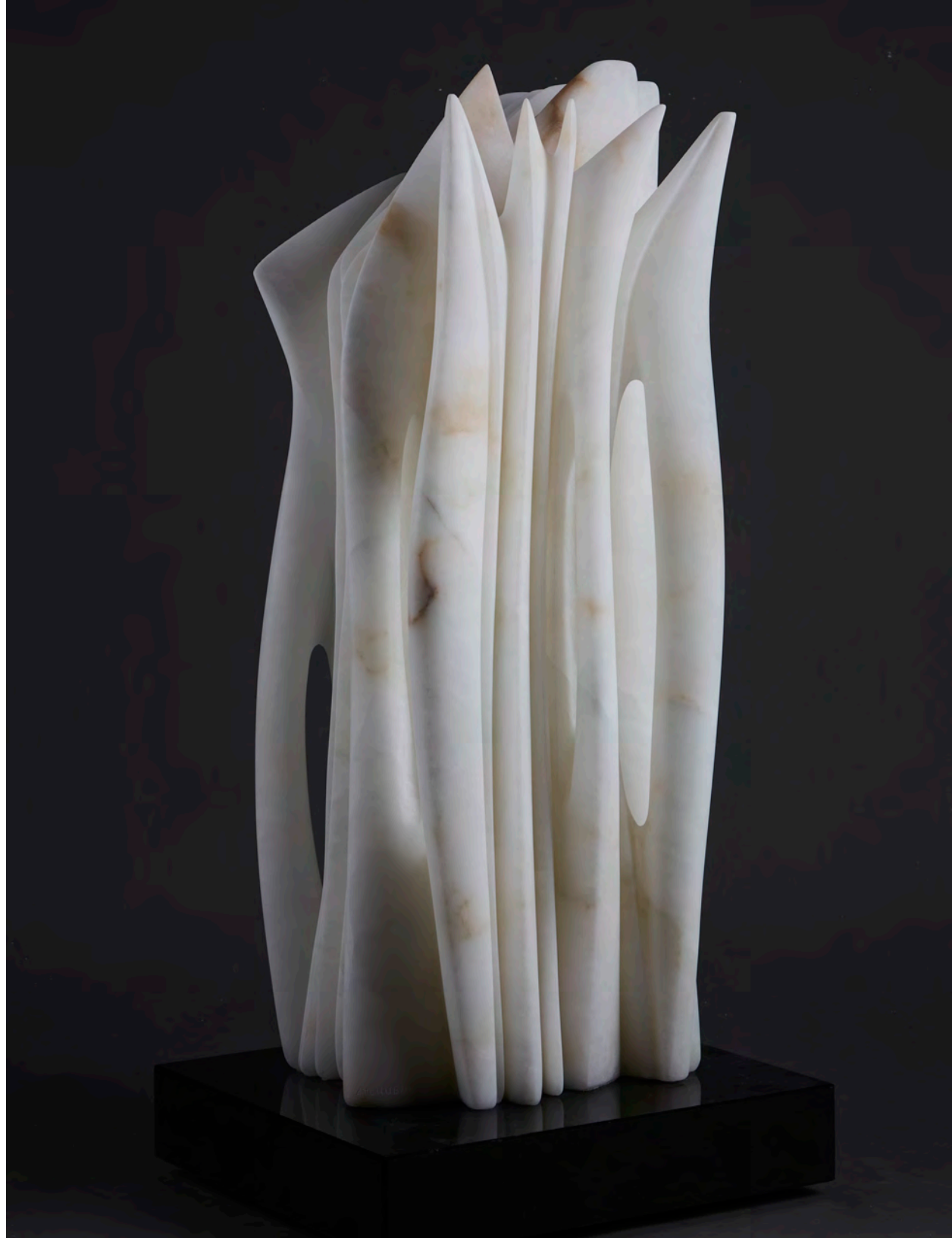
Pablo Atchugarry Untitled, 2022 Alabaster 81 x 31 x 30 cm. Sold