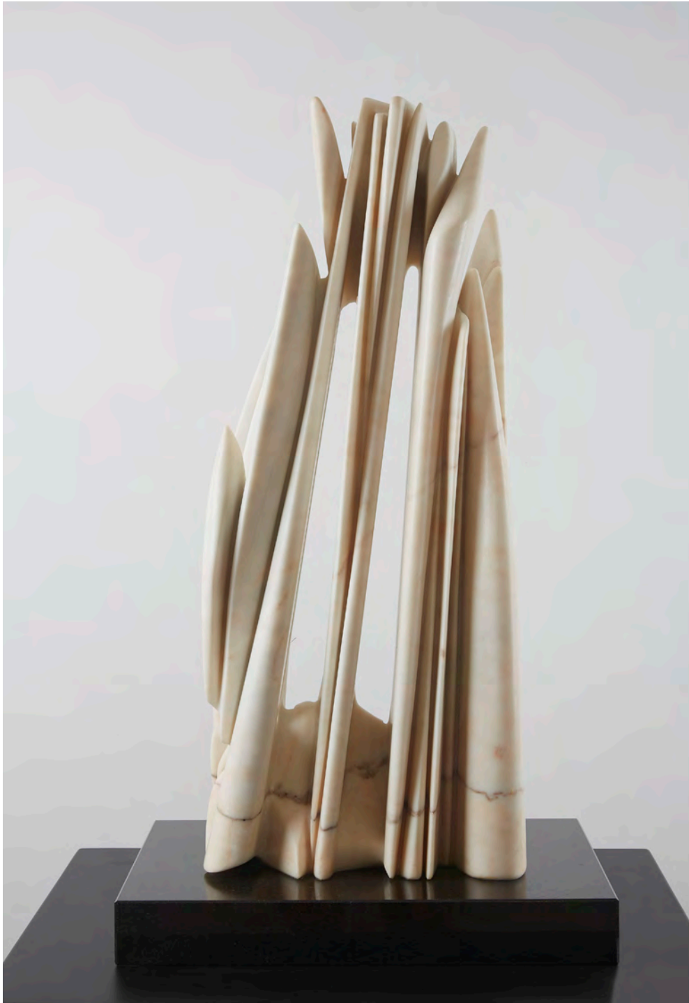
Pablo Atchugarry Untitled, 1992 Pink marble 74 x 29 x 19 cm. USD $90,000.00